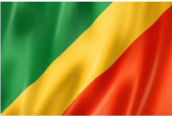
REPUBLIC OF THE CONGO