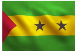
SÃO TOMÉ E PRÍNCIPE